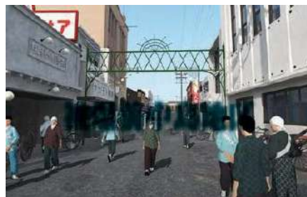
Nakajima district Before the A-bombing