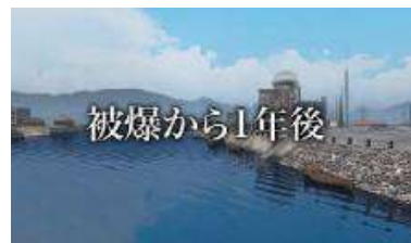
One year after the bombing The film tells you the story how people stand up and step forward from the ashes with A-bombed buildings. We'll pursue world peace.