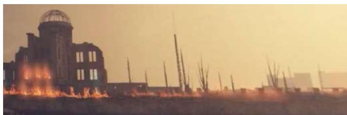
Riverside view of A-bomb Dome Through the VR headset, you can see and feel the townscape before and after "the moment".