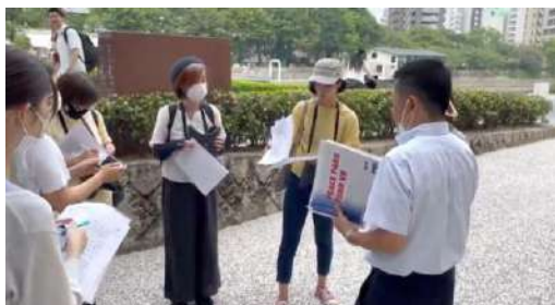
English-Speaking guide available