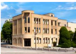
Depart from Rest house location of nearest A-bomb survivor.